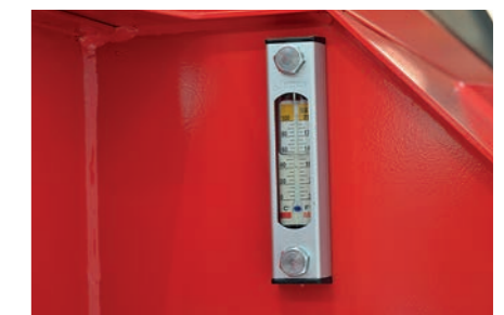
Large oil tank capacity and sight glass.