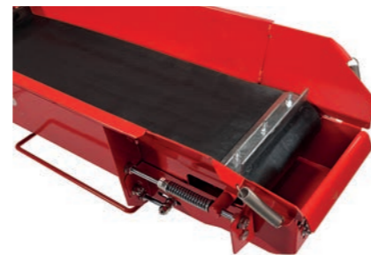
Patented cleaning outfeed conveyor as standard. The groove at the end of the outfeed conveyor separates debris from the firewood.