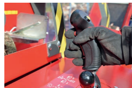
Electrical control of sawing and splitting with just two buttons.

In the 38 Pro processor, the AC10 automatic chain tensioner functions mechanically. The patented AC10 system maintains the chain at optimal tension, improving the efficiency of the sawing process and providing a significant increase to the life span of the chain and bar. In addition to sawing and cutting, the joystick is used to adjust the height of the splitting blade and control the infeed conveyor. The 38 Pro model also features the familiar Hakki Pilke cleaning outfeed conveyor, which separates debris from firewood without any additional accessories. As a new feature, the machine also includes a control valve for the outfeed conveyor – this can be used to reverse or stop the conveyor belt as necessary.