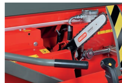
Together, the AC10 and electrical saw control ensure fast and uninterrupted operation.