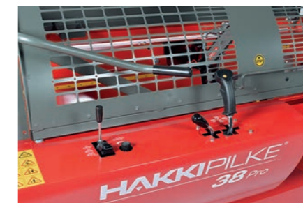
The ergonomic and easy-to-use control panel includes all the controls needed to operate the machine.